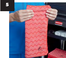
Open Microfiber cloth once to change sides