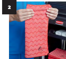
Fold Microfiber cloth in half