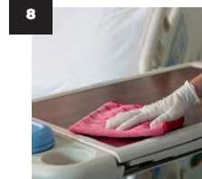
Repeat steps 2 through 7 to use all eight sides