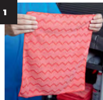
Begin with open, clean microfiber cloth