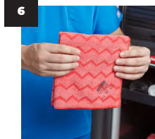
ReFold to expose two fresh cleaning sides