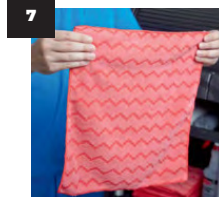
Open cloth fully once four sides have been used